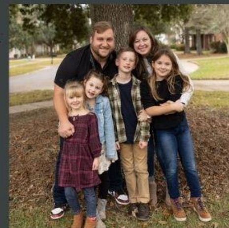
Harrison & Taylor