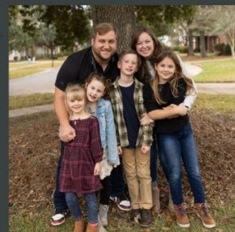
Harrison & Taylor