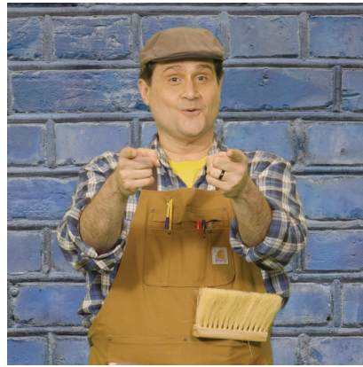
is with you