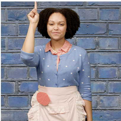
that Jesus is the Christ,