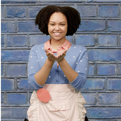
"These are written