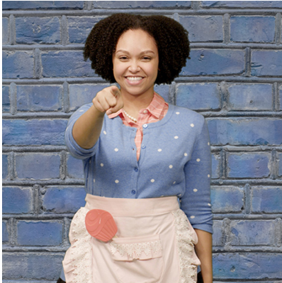
so that you