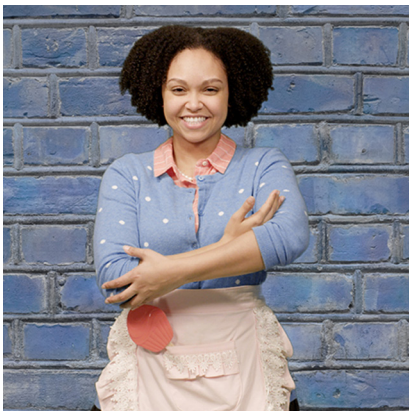
the Son of God.