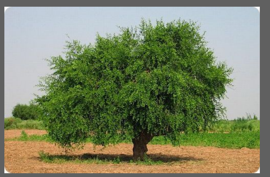
Zechariah 4.10: Who dares despise the day of small things?